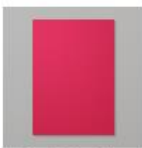
Real Red A4 Card Stock [106578] £9.50