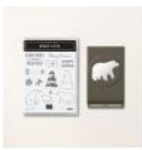
Beary Cute Bundle (English) [162023] £40.50