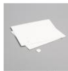
Stampin' Dimensionals [104430] £4.00