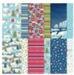
Beary Christmas 12" X 12" (30.5 X 30.5 Cm) Designer Series Paper [162015] £11.75