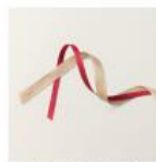
Real Red & Burlap Ribbon Combo Pack [160586] £8.50