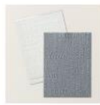
Christmas Tidings Embossing Folder [162115] £8.00