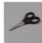
Paper Snips [103579] £10.25