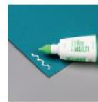
Multipurpose Liquid Glue [154974] £5.25